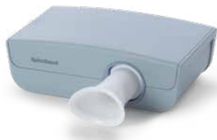
Ultrasound spirometer SpiroScout SP plus

The spirometry option offers FVC, SVC and MVV with a large selection of reference standards, pre and post tests, as well as interpretation of the FVC results. The device provides feedback on the procedure's quality during the test and after each trial. An incentive screen is included for trials with children.